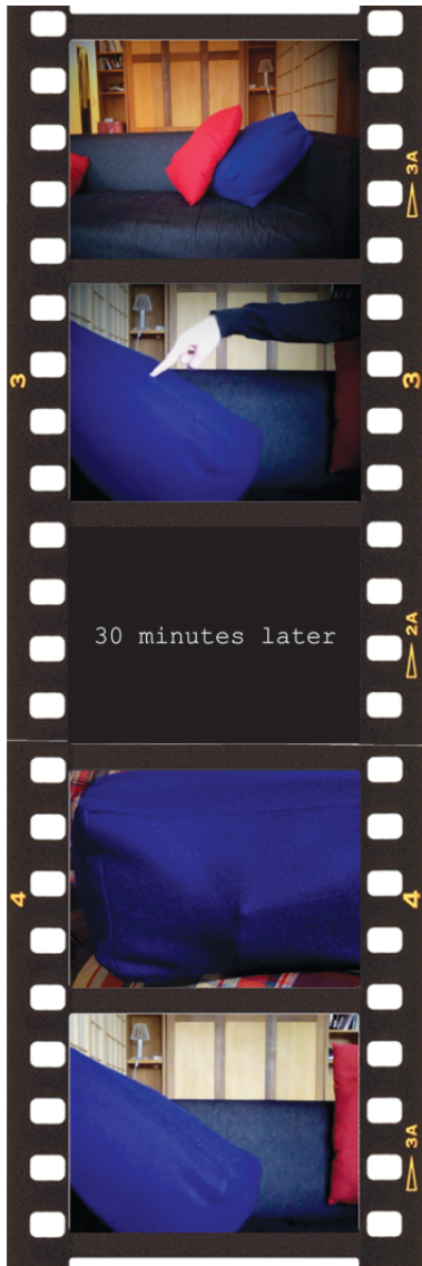
Figure 3. Playing with timing and speed. The still images cannot represent authentically the movements in the videos.

apartment. The first clip is a finger pressing on the surface of the blue cushion. A screen title reads: “30 minutes later”. The next clip is a close frame of the surface of the cushion pushing back where the finger was pressing earlier. The sequence ends with a picture of the cushion on the sofa. In this sequence, the compelling interaction can be attributed to the logical, but ambiguous relation between input and output. The timing adds some ambiguity to the interaction and might arouse curiosity. This example shows that by changing the timing between input and output we can create different qualities of interaction. If the reaction was immediate, the design qualities could be playfulness and responsiveness. If the reaction slowly appeared or was apparent only after a day, the qualities would be different. Mystery and ambiguity would dominate and playfulness would almost disappear.