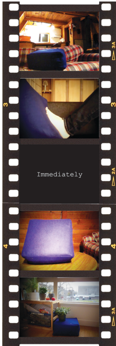
Figure 4. Playing with context.

awareness to small details about the movement, such as the small shaky bumps in what seems a regular movement. Because we filmed in a university lab, we were able to create simple spaces where we could interact with the cushion. The exquisite corpse technique allowed us to present simple interactions outside of context, but to add context at the beginning and ending of the video.