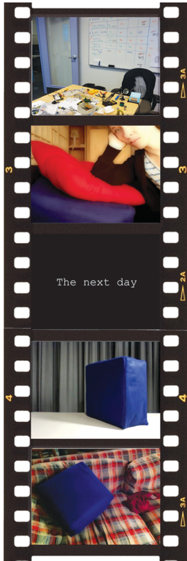
Figure 5. Focus on the action

the things you want to create yourself is the quality and advantage of this technique. In our exquisite corpses technique, we present a structure, but still lack complete randomness in the choice of clips we put together.