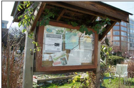
Figure 3. Notice board for sharing information.