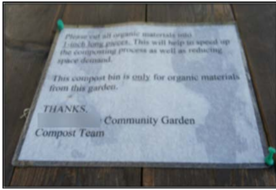
Figure 2. A weathered sign next to the compost box.